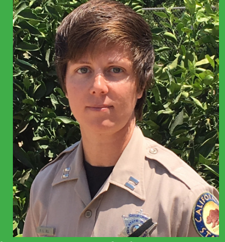
the operating engine display.

There are more exciting things to come in the future as well. A team of dedicated volunteer engine enthusiasts have completed the restoration of our Western Engine Water Pump, an antique 1930s engine donated to California Citrus SHP by the Riverside Highland Water Company. The engine was originally located in Highland and was used to pump water to citrus groves in Riverside County. Now that the engine is restored and can be run, California Citrus SHP will soon conduct special tours and demonstrations of